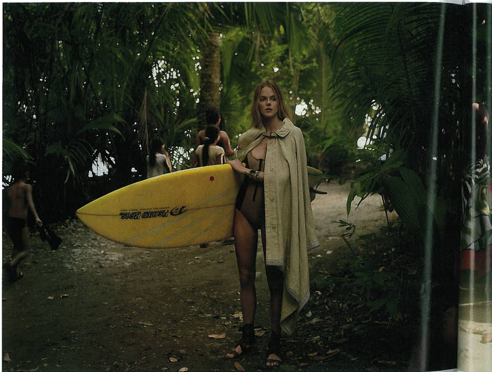
Linen cape, $1,955, sandals, $595, both, Chloé . Cape at Neiman Marcus. Neoprene maillot, Lisa Marie Fernandez , $385. Watch, Movado , $1,695. Silver feather bracelet, Vicki Turbeville , $190.