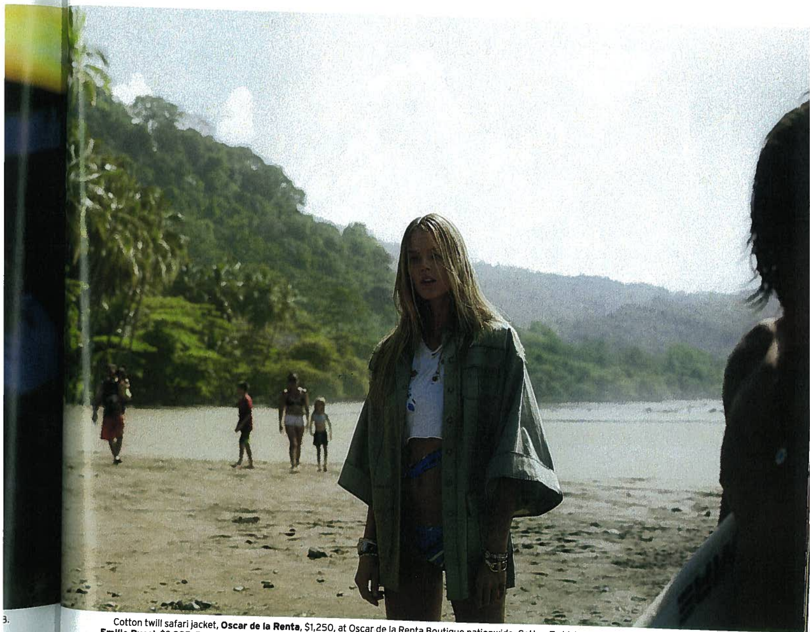
3. Cotton twill safari jacket, Oscar de la Renta , $1,250, at Oscar de la Renta Boutique nationwide. Cotton T-shirt, Armani Exchange , $25. Printed swimsuit, Emilio Pucci , $3,995. Fossil shark-tooth necklace, Dezso by Sara Beltran , $2,575. Silver and leather cuff, Michele Lerner , $1,338. Yellow, rose, and white gold bracelet with diamonds, Cartier , price upon request. Yellow gold snake chain watch, Van Cleef & Arpels , price upon request. Silver feather bracelet, Vicki Turbeville , $190. For details, see Shopping Guide.