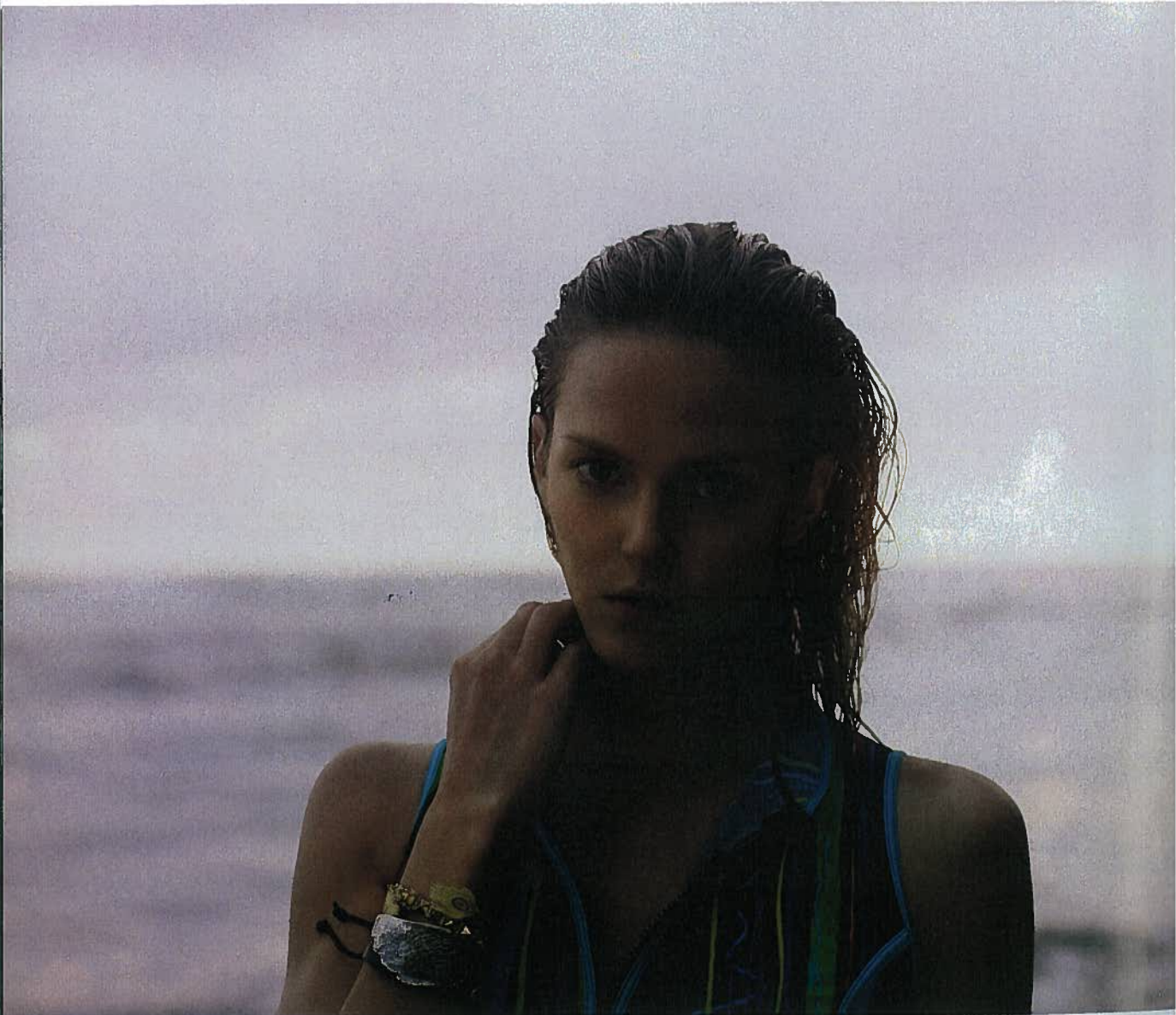
Elastane-blend scuba vest, Emporio Armani , $250, at Armani/5th Avenue, NYC. Sterling silver and leather bracelet, Michele Lerner , $1,338. Yellow gold spike bracelet, Anita Ko , $3,750. Gold feather bangle, Aurélie Bidermann , price upon request.