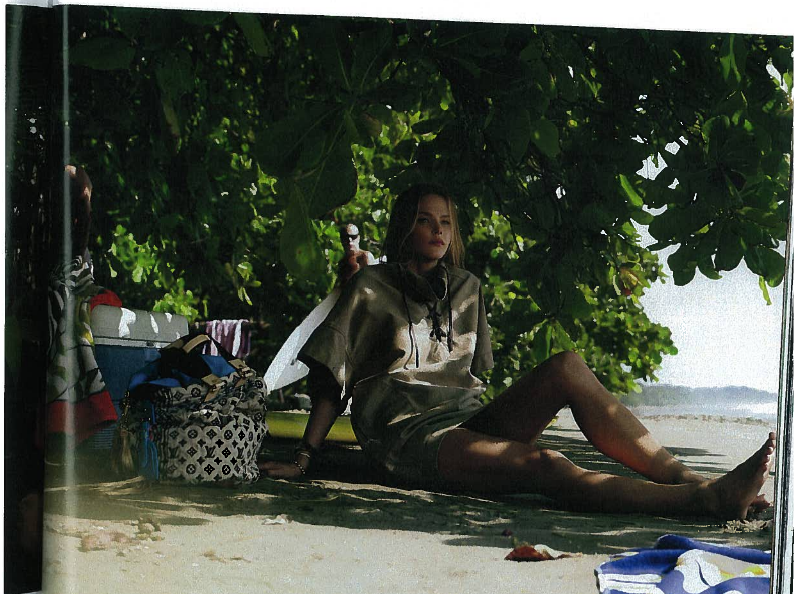
Cotton dress, Céline , $2,350, at Blake, Chicago. Silver and leather cuff, Michele Lerner , $1,338. Yellow gold spike bracelet, Anita Ko , $3,750. Gold feather bangle, Aurélie Bidermann , price upon request. Duffel bag, Louis Vuitton , $3,920. For details, see Shopping Guide.