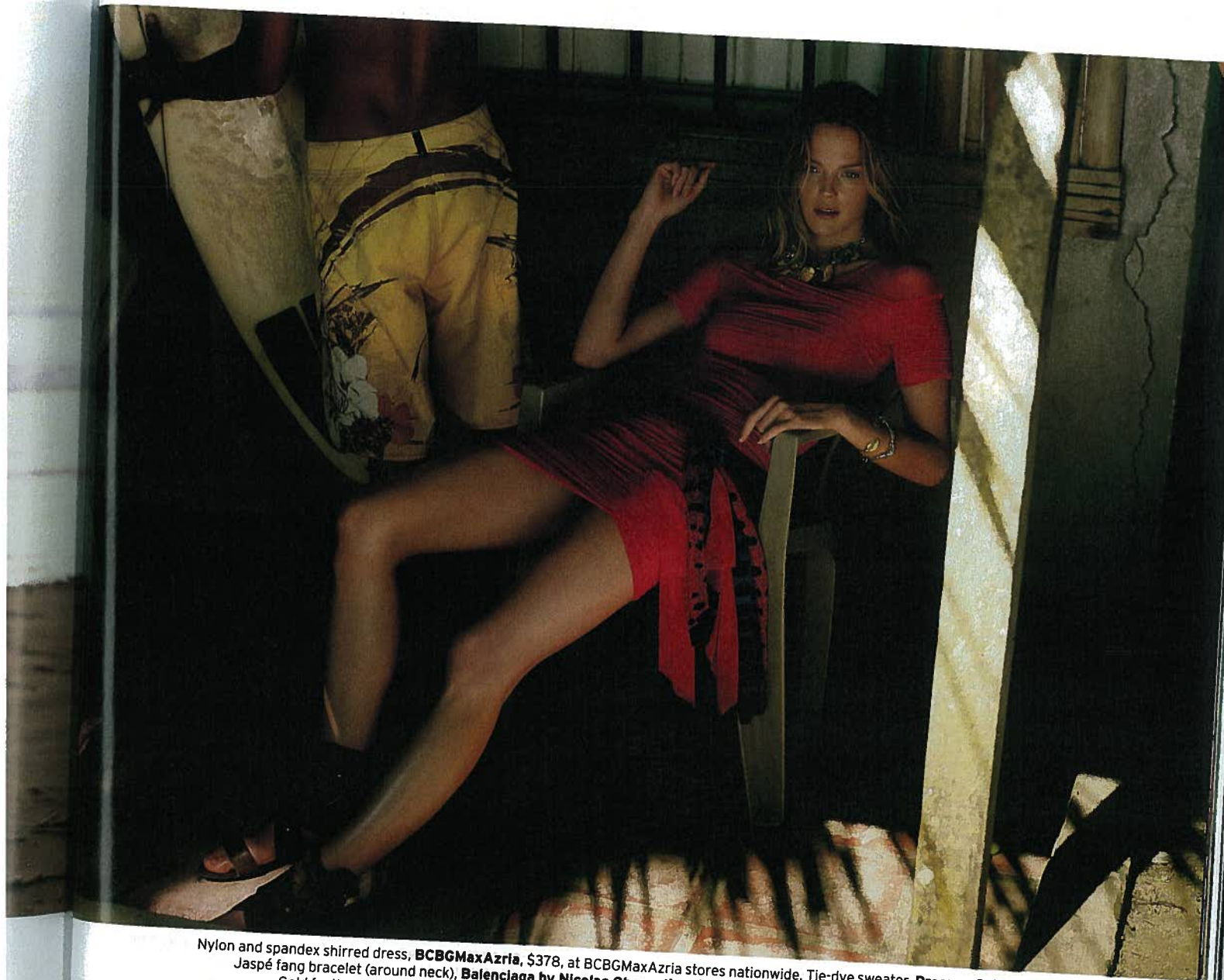
Nylon and spandex shirred dress, BCBGMaxAzria , $378, at BCBGMaxAzria stores nationwide. Tie-dye sweater, Proenza Schouler , $1,335. Jaspé fang bracelet (around neck), Balenciaga by Nicolas Ghesquière , $1,995. Silver and leather cuff, Michele Lerner , $1,338. Gold feather bangle, Aurélie Bidermann , price upon request. Sandals, Chloé , $595. For details, see Shopping Guide.